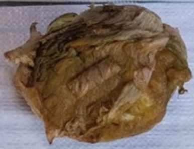
15 Days after Harvest