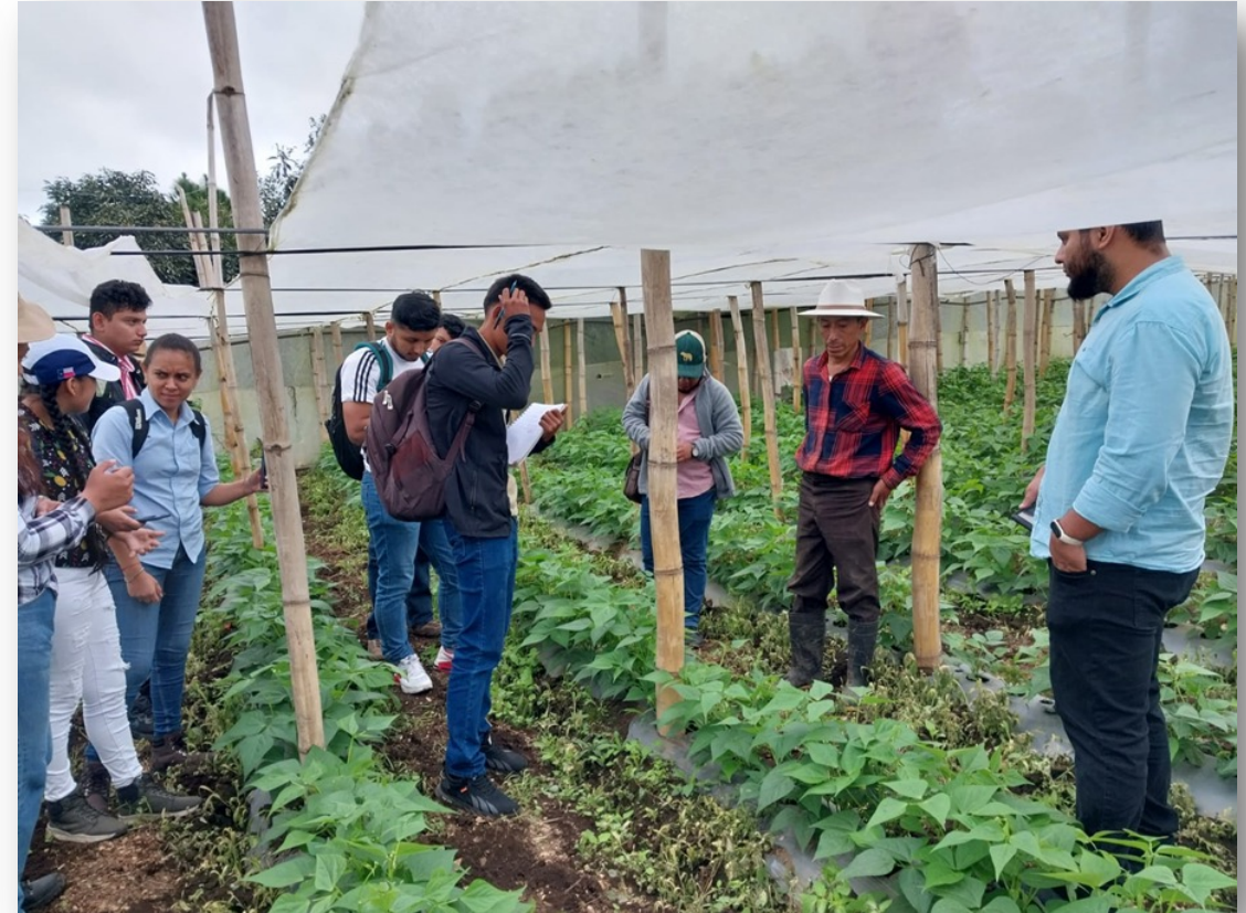
Present different Monty's technology in process to beans trial...