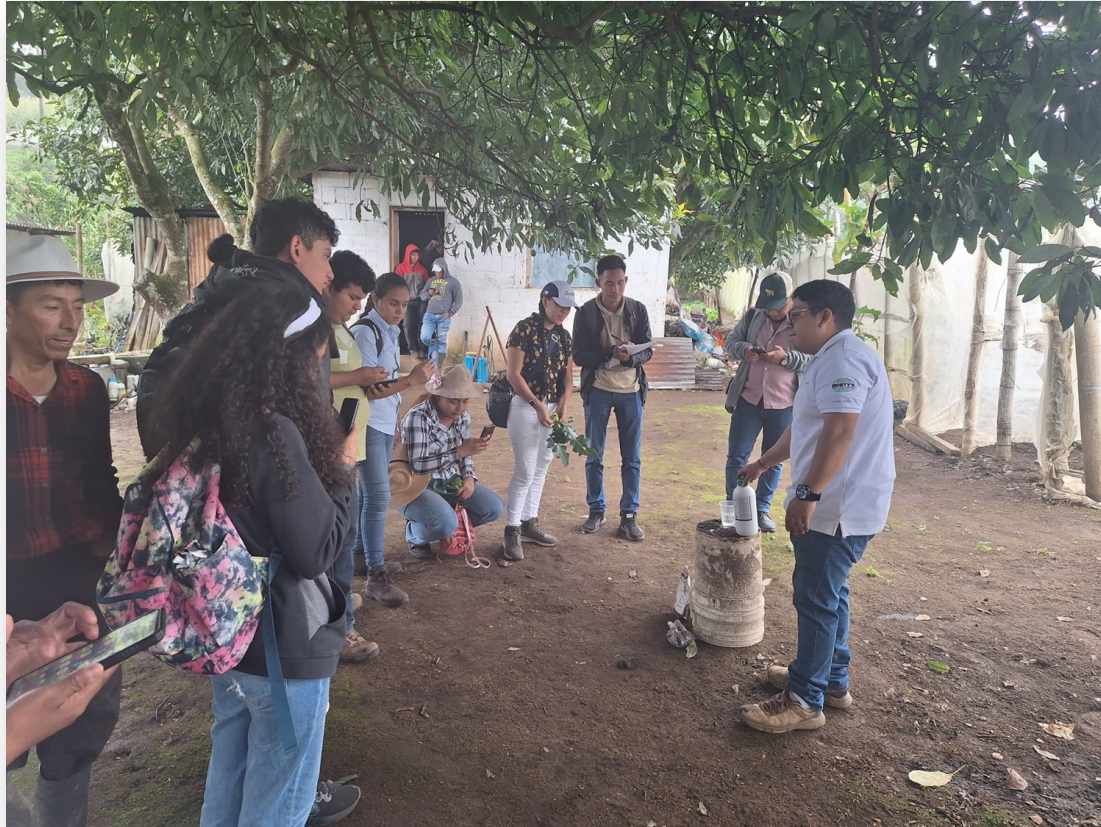
Show different Monty's technology