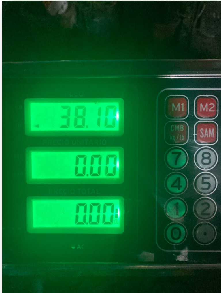
Weight Monty's ....